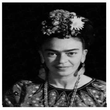
Figure 1: Freda Kahlo.