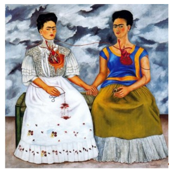
Figure 4: The 2 Frida (1939).

Frida played an important role also in reviving these traditional dresses, some of them were no longer made, and promoting the Mexican culture and its textile wealth, all over the world. However, she was not wearing the regional costume without a certain degree of transformation, and very often she was modifying it using for example Spanish Cotton fabric, or Chinese silk fabric with dragon motifs and giving it an indigenous look. There was in reality a mix of elements from Mexico, Asia and Europe. "Frida Kahlo stylized her Tihuana dress with the Mexican rebozo , a long rectangular fringed shawl, draped about her shoulders and a massive string of Aztec beads about her throat. Her hair was also frequently braided and beribboned in the Tihuana style." (Jiyun)