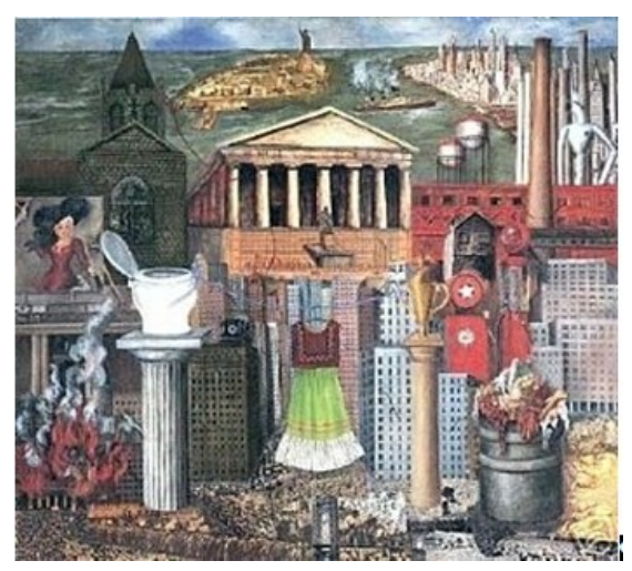
Figure 3: Painting Alla Cuelga Mi Vestido o Nueva York (1933).

The costume is acting as a Sign and shows that who wears this belongs or supports this culture. The national clothing is a kind of fixed costume which refers constantly to the same. It is generally fixed in time and unchangeable. However, Frida Kahlo didn't wear it as it is. She was mixing it with other elements belonging with European culture and created a kind of fashion bricolage and her specific identity.